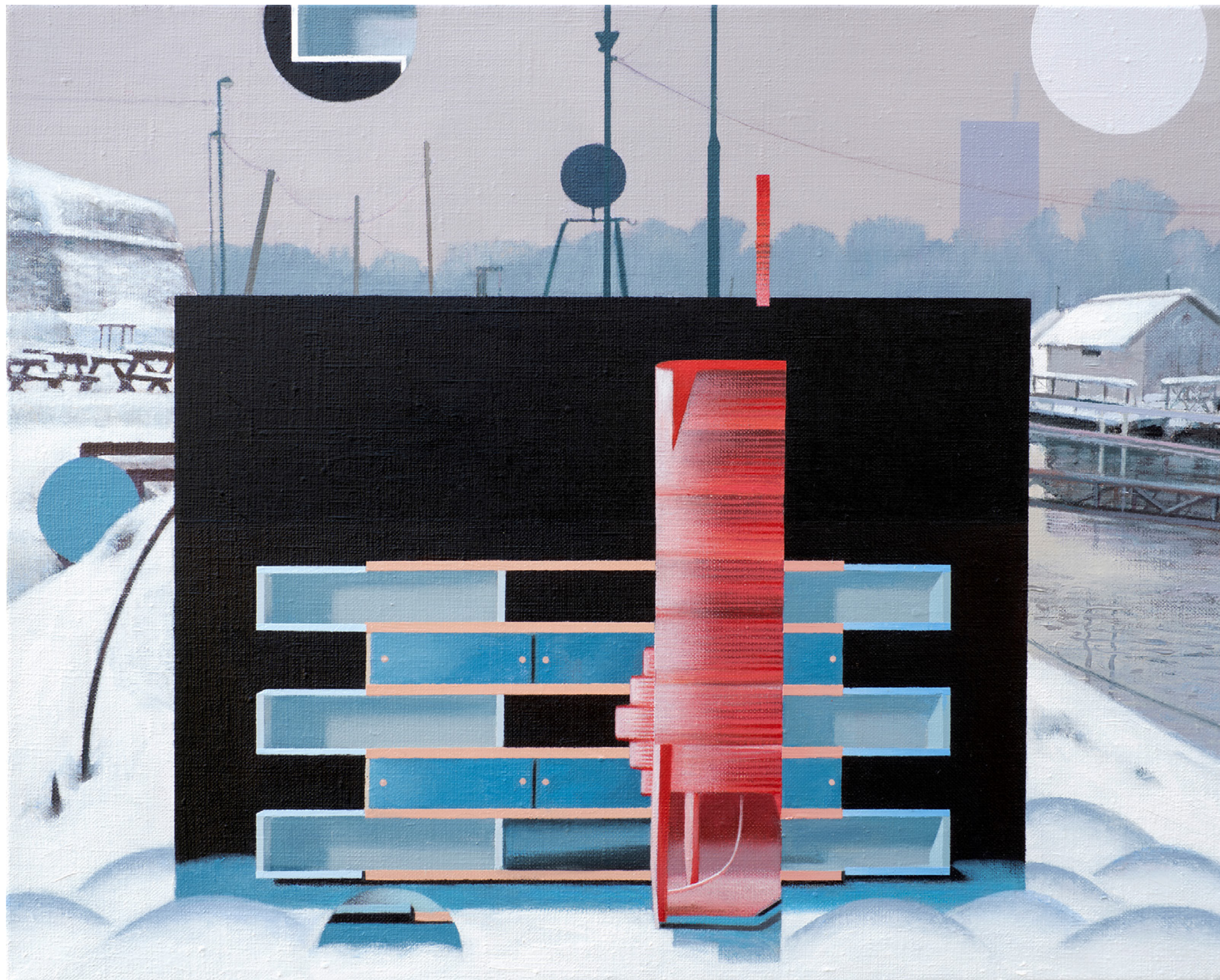
Dört Yol (Four Ways) (2020)