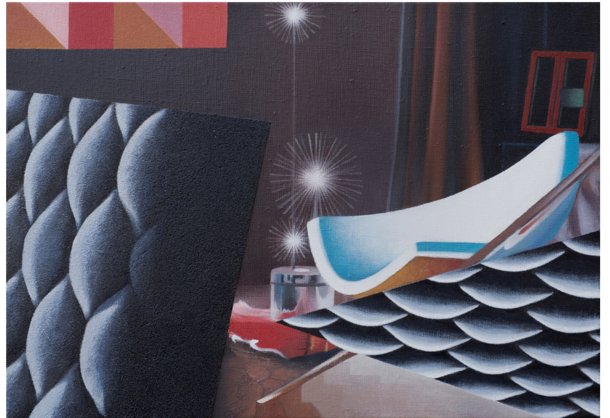
The Siena Room (2021)