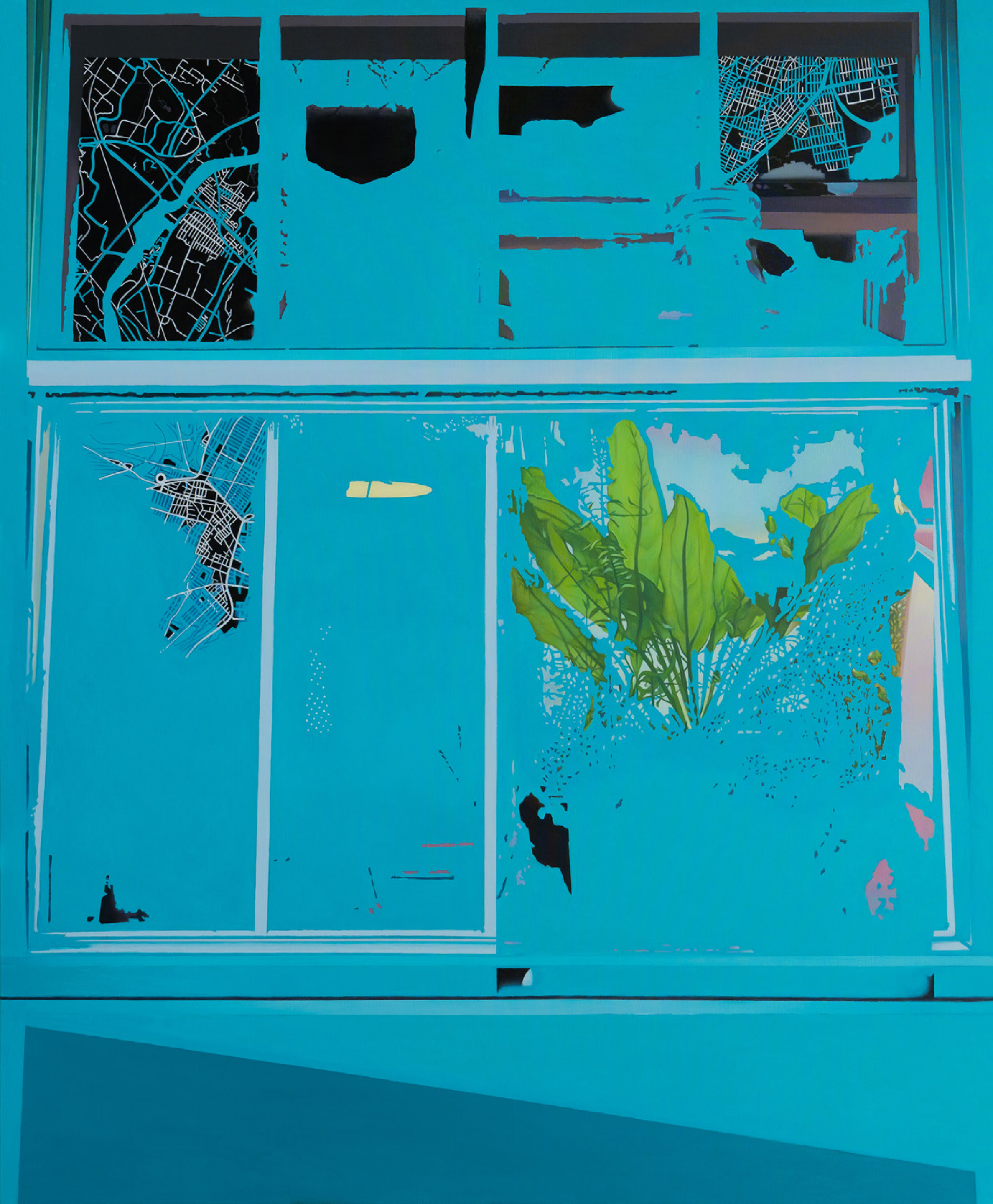
The Blue Window (2025)