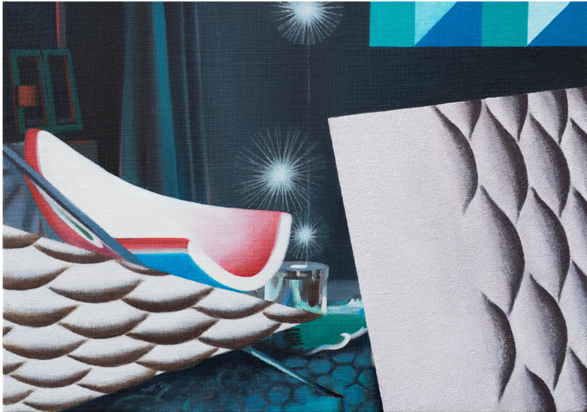
The Blue Room (2021)